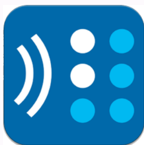
BARD Mobile App Photo of mobile device with app BARD Mobile App icon and screenshot of wish list

devices interested in using BARD and BARD Mobile, visit the BARD website listed at the end of this article. If you are not registered to use BARD, click on the BARD Application instructions link, and then the Link to BARD Application for Individuals. Fill out the application and submit it. You will receive an email verifying your acceptance and a temporary password to log in to BARD.