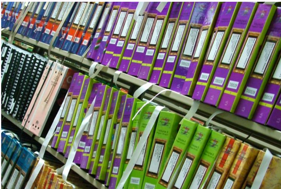
Shelves of textbooks at BTB

Please send copies of vision reports listing central & peripheral field of vision for visually handicapped and blind students registered with the school by January 1, 2014 to Lynda Lowin, 800 Governors Drive, Pierre, SD 57501 or lynda.lowin@state.sd.us . These are needed to request Federal Quota funds that can be used to obtain textbooks and equipment from the American Printing House for the Blind when available.