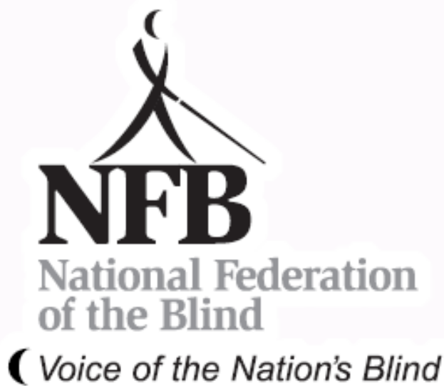
Logo of National Federation of the Blind

Are you a legally blind college student living in the United States or Puerto Rico? This annual program offers 30 scholarships worth from $3,000 to $12,000 to eligible students, from high school seniors beginning their freshman year in the fall semester of 2014, up through grad students working on their PhD degrees. These merit scholarships are based on academic excellence, community service, and leadership. In addition to the money, each winner will receive assistance to attend the July 2014 NFB Annual Convention in Orlando, Florida, providing an excellent opportunity for high-level networking with active blind