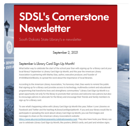
Cornerstone circa 2021-2023 Screenshot of September 2, 2021, edition of the Cornerstone