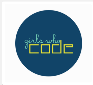
Girls Who Code