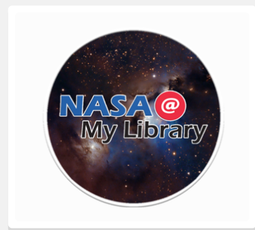
NASA @ My Library