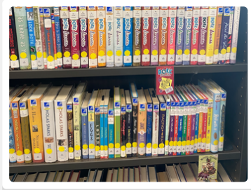
Series Shelf Tags