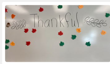
Interactive Thankful Board