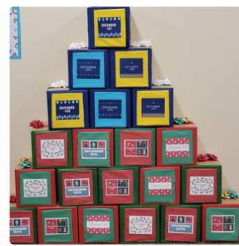
Christmas Book Countdown