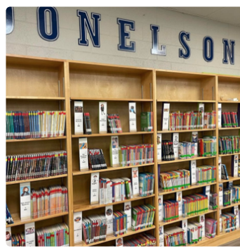
Unique Shelf Markers