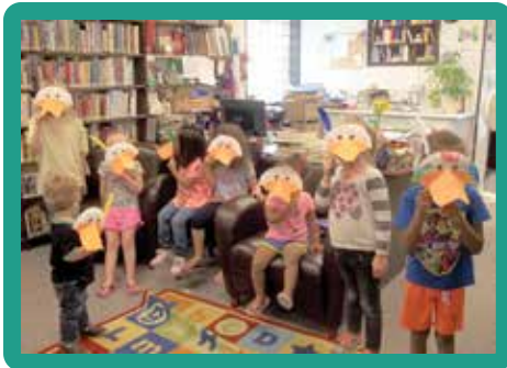
LEFT: Wall Community Library children's craft program