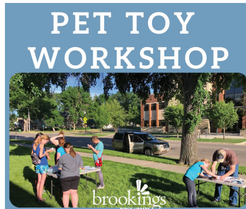
Brookings Public Library