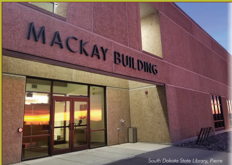
South Dakota State Library, Pierre